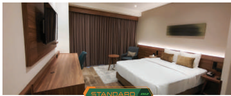
STANDARD BIZ FUJITAYA