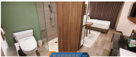
EXPRESS BIZ FUJITAYA