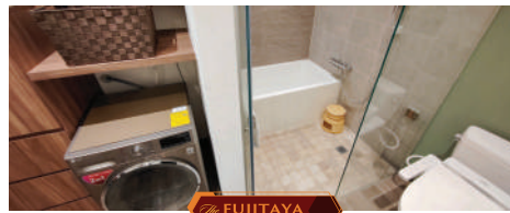
The FUJITAYA FUJITAYA